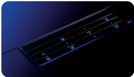
InFocus LiteTouch Keypad

The sleek backlit LiteTouch control panel provides one-touch access to the most commonly used projector functions.