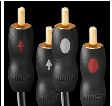
RCA ♂ ↔ RCA