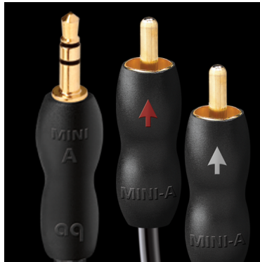
3.5MM ♂ ↔ RCA