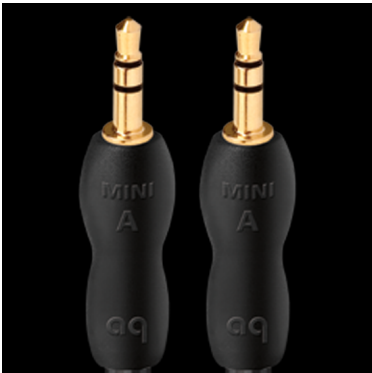
3.5MM ♂ ↔ 3.5MM