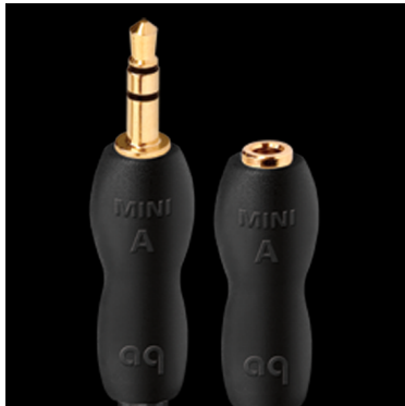
3.5MM MALE ♂ ↔ FEMALE