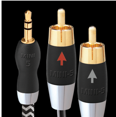
3.5MM ↔ RCA