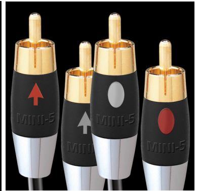
RCA ↔ RCA