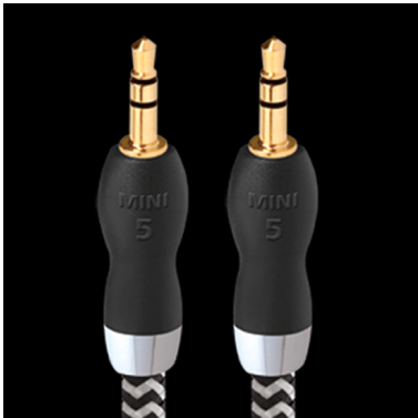
3.5MM ↔ 3.5MM