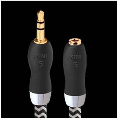
3.5MM MALE ↔ FEMALE