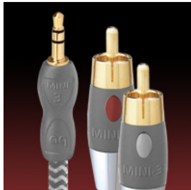
3.5MM ↔ RCA