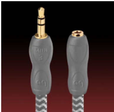
3.5MM MALE ↔ FEMALE