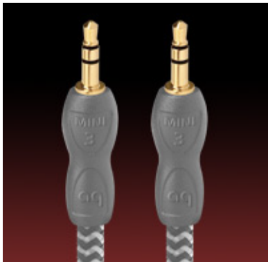
3.5MM ↔ 3.5MM