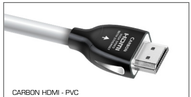
CARBON HDMI - PVC